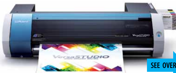
VersaStudio signmaker BN-20