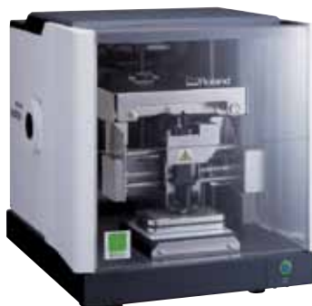
Metaza impact engraver MPX-90