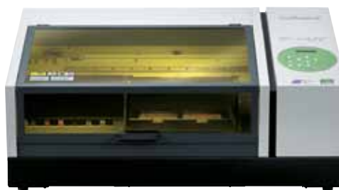
3D printing VersaUV LEF-12