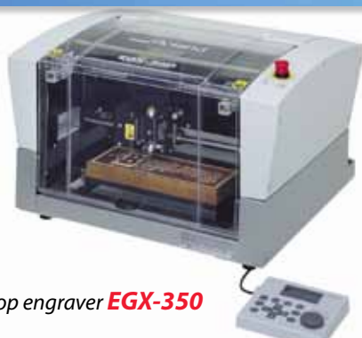
Desk top engraver EGX-350