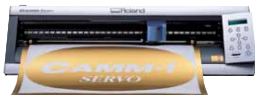
Camm-1 series vinyl cutter GX-24