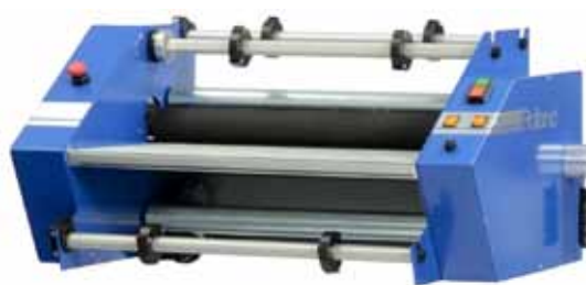
VersaLAM cold laminator